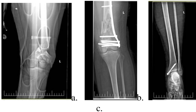
Figure 2. Study case 2 (O.A., 18 yrs). a). Comminuted supracondylar and intercondylar fracture (bone extrusion) left femur; b). Reduction under image intensifier and fixation with sliding plate; c). Nondisplaced left medial malleolus fracture fixed with two cancellous screws under image intensifier.