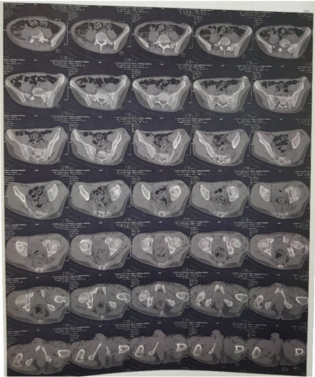
Figure No. 4 - Pelvic bone CT scan