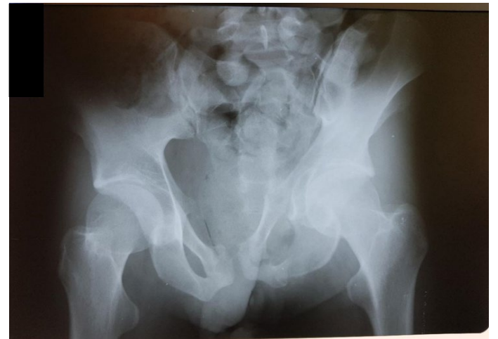
Figure No. 3 - Pelvic radiography

On the pelvic radiography (Fig. No.3) could be seen complete bilateral fracture of the superior pubic arch and left side complete fracture of the inferior pubic arch.