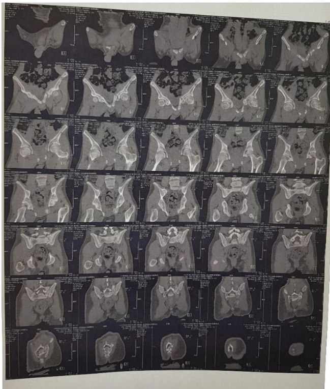
Figure No. 5 - Pelvic bone CT scan

The results of brain computed tomography investigation (Fig. No. 6) revealed craniocerebral lesions: right frontal subdural hematoma with a thickness of 5 - 6 mm, left frontal hygroma, without deviation from the midline.