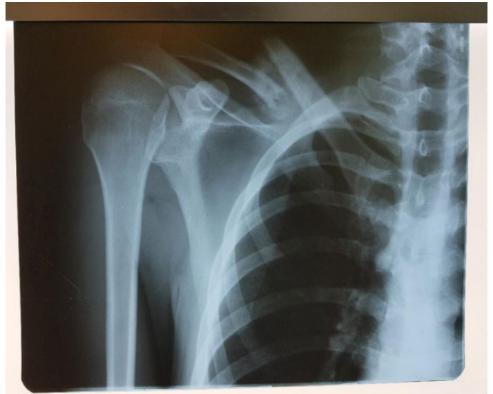
Figure No. 2 - Right clavicular radiography

Right clavicular radiography (Fig. No.2) showed an old right middle-clavicular fracture with displacement and vicious calyx.