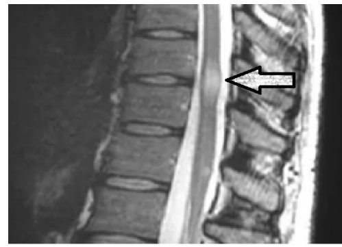
Fig. 2 .– Spinal MRI (sagittal T2 flair sequence) – focal image with demyelination aspect reaching the dorsal level (T10-T11) of the medullary cord.

The patient was tested for Hepatitis B and C, and she was positive for hepatitis B (agHBs positive). She received a recommendation to see a gastroenterologist and to make further investigation. After this admittance, the patient had two more relapses each at approximately 6 months. During this time the patient received treatment with Baclofen 10 mg 2 tablets/day for the spasticity. For the urinary retention, the patient learned to catheterize herself. Of course she started physiotherapy – kinetherapy. Because of Hepatitis B diagnosis we did not start any interferon or other immunosuppressive treatment. All in all, all these gathered together, allowed us to establish the final diagnostic: Pure spinal multiple sclerosis.