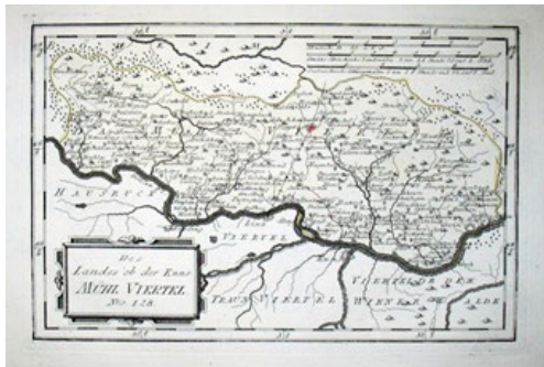
Fig.1: 1791 Austria map which expose the waters from the area by Franz Johann Joseph von Reilly (2)