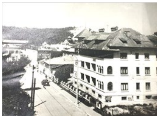
Fig. 4: Balneary Sanatorium of Pucioasa in the 1970 is- personal archive