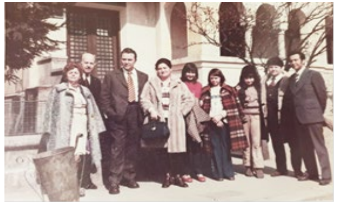
Fig. 6: Medical Doctors returning from the International Rheumatology Congress – Kyoto, Japan in 1974