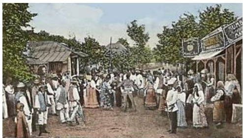
Fig. 2: Image from an assembly in Pucioasa from the year 1880 - https://mapio.net/pic/p-10833302/ (3)