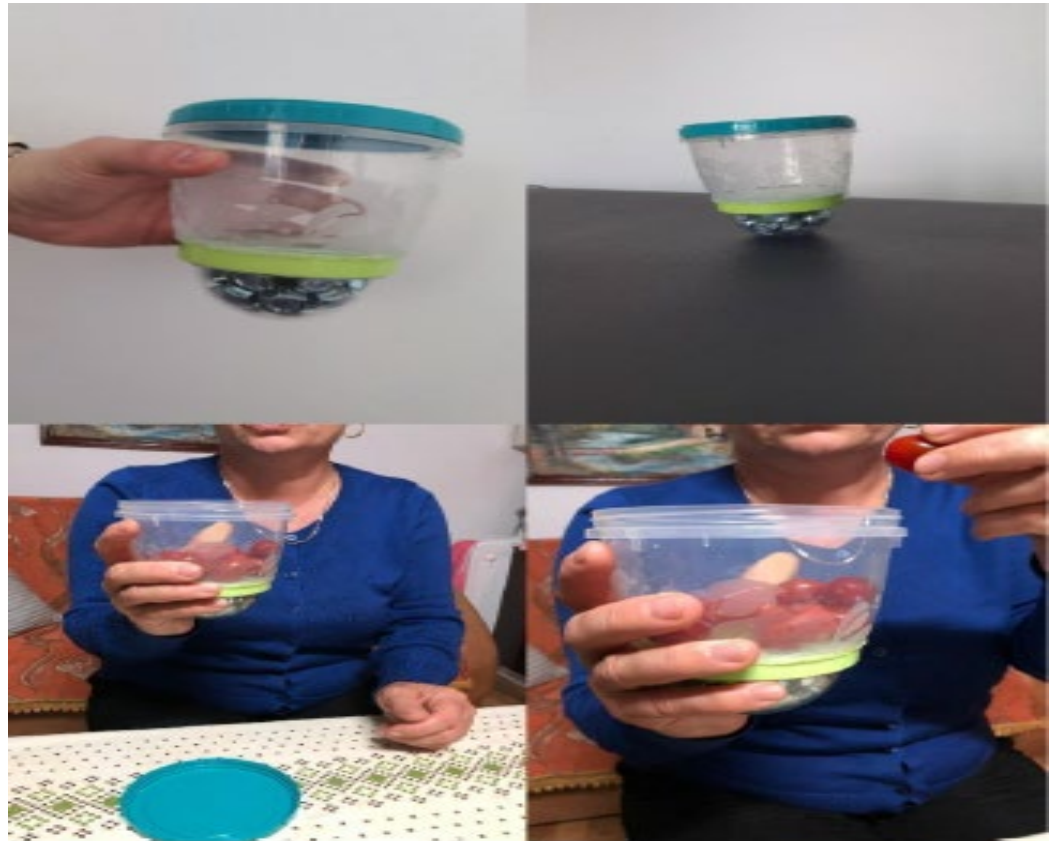
Fig 10. Food storage device.

Serving meals can be a real challenge for patients with Parkinson's disease, so we thought of a device to make this task easier for them, freeing them from the fear that they might spill the food bowl in public. At the bottom of a plastic container I glued a lid of the same material that I filled with metal nuts, to give as much stability as possible in the patient's hand. The good thing about this device is that its weight can be changed by removing a few nuts from the bottom of the device which is even completely removable.