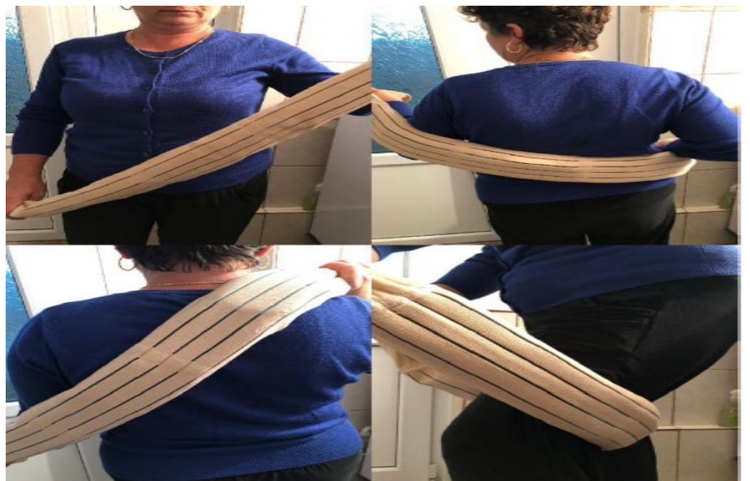
Fig 9. Body hygiene device.

Body hygiene is often a challenge for patients with Parkinson's disease, which is why this device has been designed to make it easier to wash both the back and the hard-to-reach places with a minimum of effort. So, I put a bath sponge on the entire length of a shaping belt. After positioning, the belt was folded in half and sewn to keep the sponges in place. The material of the belt has a moderate abrasiveness and is suitable for the type of use for which it was created.