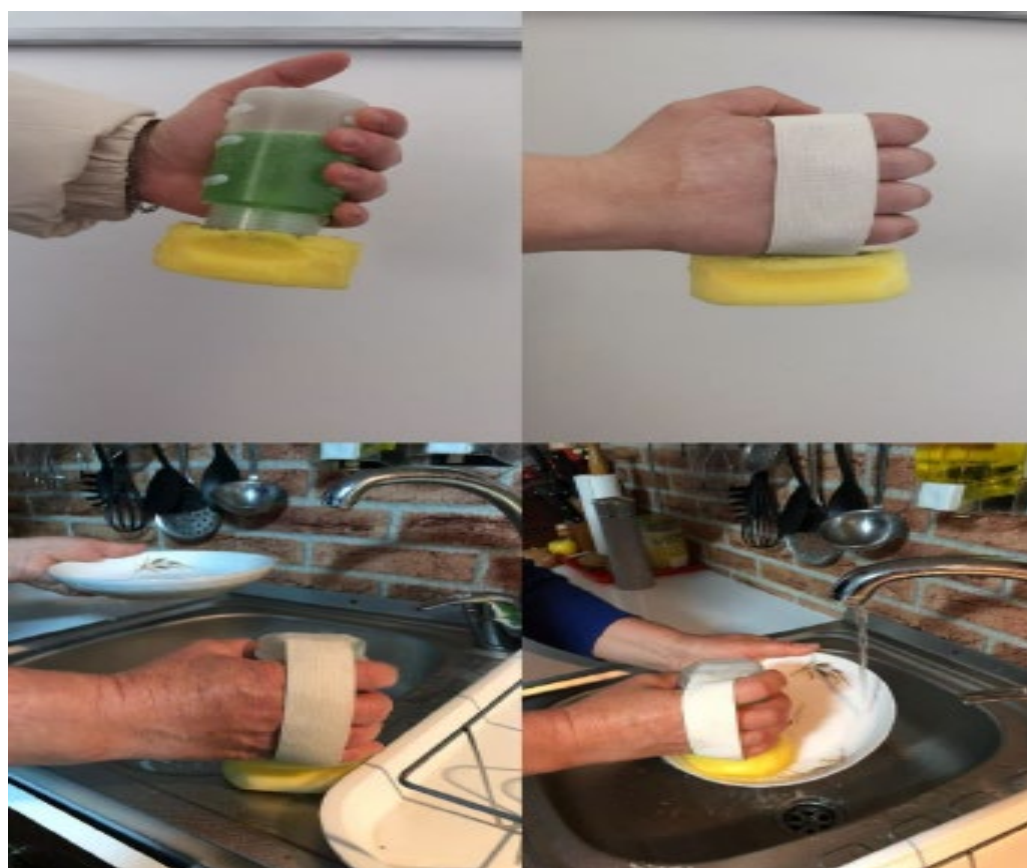
Fig 1. Dishwasher.

The first is effective both for patients with early Parkinson's disease and for those with severe symptoms. Insert the patient's hand between the handle and the elastic (Fig.1.), Then press the container that will fill the sponge with dishwashing detergent several times with the other hand. The grooves on the handle, made with the soldering gun, help to hold the device as well as possible, so that the patient will not slip his hand during use.