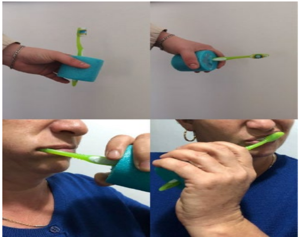
Fig 4. Toothbrush.

In order to achieve good oral hygiene, in addition to the toothbrush, we reinterpreted, through common elements, a device that facilitates the use of toothpaste by distributing an ideal amount of product, as poor grip and reduced muscle strength of Parkinson's patients restrict proper use of the toothpaste bottle. So, on a baking sheet, I evenly distributed balls of toothpaste and then sprinkled baking soda so that they would keep their shape, solidify on the outside, maintaining their effectiveness. After the paste reached its final shape, the balls were placed in an empty container of candy, found commercially. A piece of foam tube was attached around the container, using the soldering gun, inside which were metal nuts, inserted in order to facilitate grip and reduce tremor, through the stability conferred by the added weight.