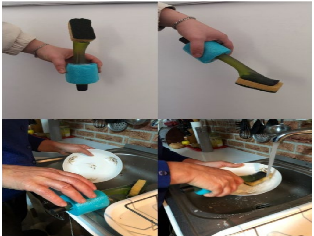
Fig 2. Dishwasher.

Other household activities include cooking, so we developed a device designed to help patients peel vegetables and fruits. The device is very simple and practical, representing a standard vegetable peeler, which can be easily found in the market, inserted in a foam tube, which has inside metal nuts fixed with a soldering gun, to give it something more weight and easier to handle.