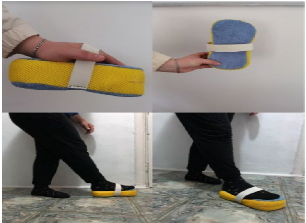
Fig 6. Sponge for cleaning surfaces.

As we get older, it becomes more and more difficult for patients to take care of household chores, so we have created a device that combines the useful with moderate physical activity. In the middle of the length of a microfiber sponge I sewed a piece of elastic fabric on either side of it, a device that can be used by patients to clean the floors, using the lower limbs and giving them the opportunity to perform a low to medium intensity physical effort, but with a fairly significant positive impact on patients' quality of life. Patients can perform both flexion / extension and abduction / adduction movements.