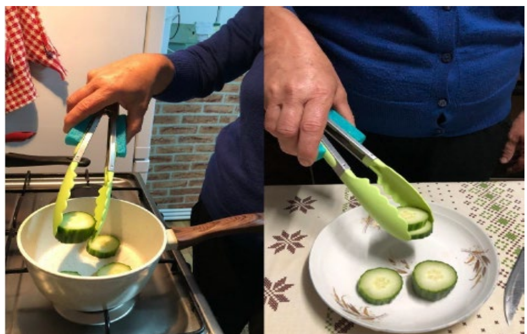
Fig 7. Kitchen tongs.

As with many of the devices created, I added pieces of foam to a kitchen tong to handle the grip.