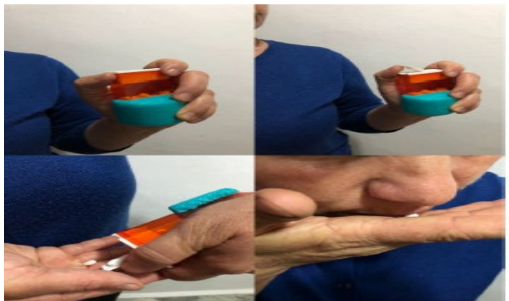
Fig 5. Toothpaste.

In order to achieve good oral hygiene, in addition to the toothbrush, we reinterpreted, through common elements, a device that facilitates the use of toothpaste by distributing an ideal amount of product, as poor grip and reduced muscle strength of Parkinson's patients restrict proper use of the toothpaste bottle. So, on a baking sheet, I evenly distributed balls of toothpaste and then sprinkled baking soda so that they would keep their shape, solidify on the outside, maintaining their effectiveness. After the paste reached its final shape, the balls were placed in an empty container of candy, found commercially. A piece of foam tube was attached around the container, using the soldering gun, inside which were metal nuts, inserted in order to facilitate grip and reduce tremor, through the stability conferred by the added weight.