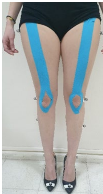
Figure 1. Application Kinesio tape

Descriptive statistics were calculated for all data. Statistical analyses were performed using the SPSS version 23 software. The nonparametric Wilcoxon test was used to compare HH shoes measurements and measurements for the KT taping applications knee joint with HH shoes, respectively, within each subject. The statistical significance level was set at p < 0.05 .