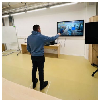
3D Vision System for arms tracking