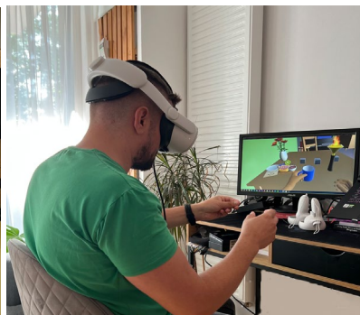
HDM for hand tracking

Our solution integrates hardware systems such as the 3D vision camera, Smart watch with software systems that together create an ecosystem for analyzing human movements and virtualize recovery processes in a similar way to video games. Our research part will continue with the testing of the application but also its improvement depending on the feedback received from the people involved in the test.