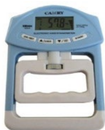
Figure 1. CAMRY- Digital Hand Dynamometer, 200lb, EH101, USA

was used. The testing procedure was conducted following the defined recommendations of the American Society of Hands Therapists [36]. The force realized at maximum hand grip (dynamometry) was measured using a digital hand dynamometer CAMRY-EH101, USA (Figure 1). The results are expressed in kilograms (kg) with a measurement accuracy of 0.01 kg. Calibration of the instrument was performed periodically during the study.