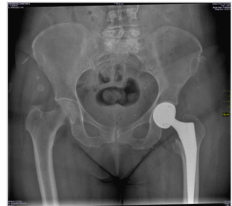
Figure 2. Hip prosthesis of the patient

To analyze the psychosocial factors that could affect the rehabilitation outcomes, the patient completed a series of questionnaires both at admission and discharge. On the HADS ( Hospital Anxiety and Depression Scale ) [4], her results corresponded to a moderate level of depression and anxiety. Social support was measured with the aid of the ESSI ( ENRICHD Social Support Instrument ) [5], the findings of which suggest that her social surroundings would not have enough influence over her recovery. Another used scale was the RLOC ( Recovery Locus of Control ) [5], which measures the person's views regarding a return to his/her preoperative circumstances; our patient relied on the strength and support of others throughout her rehabilitation process. We have also analyzed the IPQ-R ( Revised Illness Perception Questionnaire ) [6], which quantitatively measures patient perception of his/her disease; our patient suffered from a psychoemotional blockage, further augmented by her fear of using her twice operated leg (knee and hip).