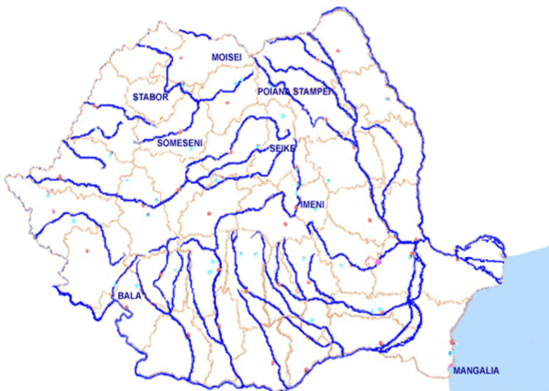
Figura 2. Principalele stațiuni din România cu nămoluri de turbă