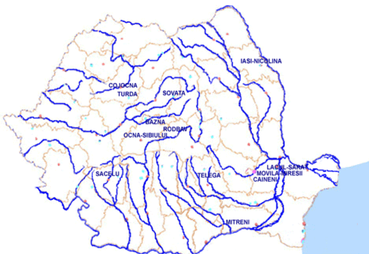
Figura 3. Principalele stațiuni din România cu nămoluri minerale