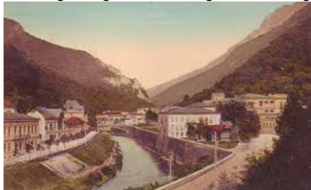
Băile Herculane (image from the end of the 19th century)

The Romans remained numerous traces: aqueducts, baths, statues, coins, votive tabule raised signs of gratitude to the gods for healing.