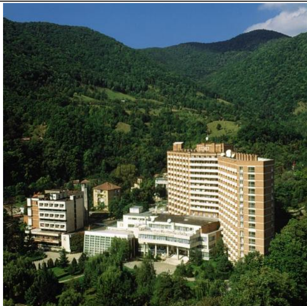
Baile Herculane, resort with millennial tradition