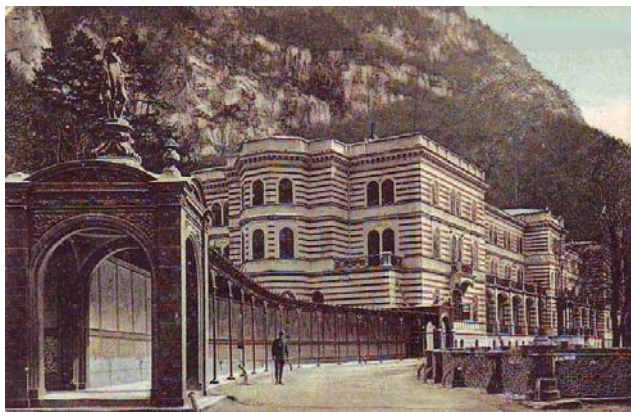
Băile Herculane (imagine de la sfârșitul sec. XIX)

The oldest bathing in Romania, dating from the time of the Romans, you wear the name "The sacred waters of Hercules" (attested documentary as a resort in 153 a.d.), famous for the therapeutic effects of its thermal waters, which, with sodium, calcium, magnesium, oligotermale, slightly radioactive, good for both internal and external cure.