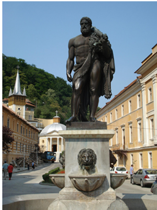
The statue of Hercules in the city Baile Herculane

Those who wish, can make trips to the monasteries in the surrounding resort Baile Herculane Prislop monastery, the monastery Tismana Monastery, monastery of Vodita, Densus.