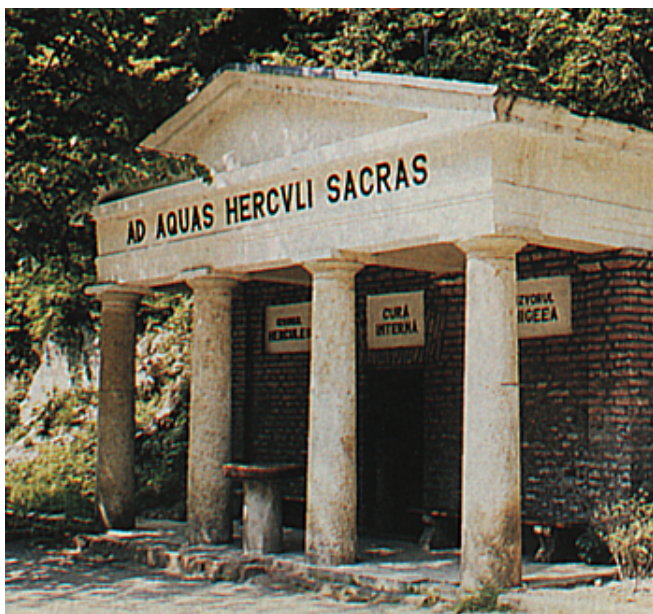
Ad aquas herculi sacras, thermal spring water of baile Herculane

The oldest bathing in Romania, dating from the time of the Romans, you wear the name "The sacred waters of Hercules" (attested documentary as a resort in 153 a.d.), famous for the therapeutic effects of its thermal waters, which, with sodium, calcium, magnesium, oligotermale, slightly radioactive, good for both internal and external cure.